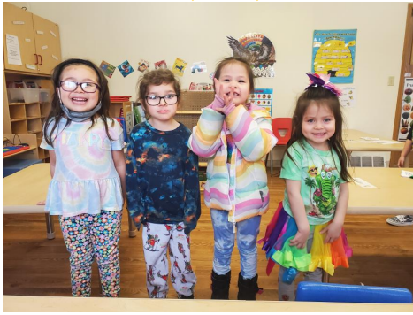
Some pictures from Dr. Seuss week!