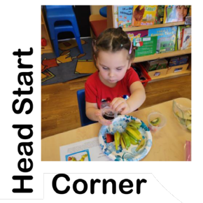
Head Start Corner