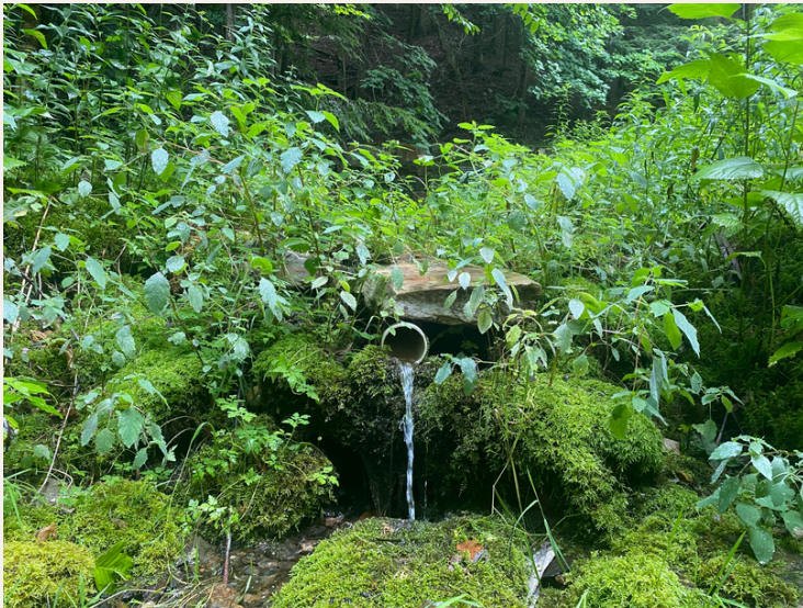
Cold Spring, Route 7, Williamstown

Mohicans traditionally regarded the area as significant for the abundance of natural springs